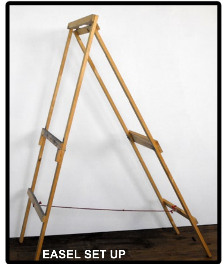
EASEL SET UP